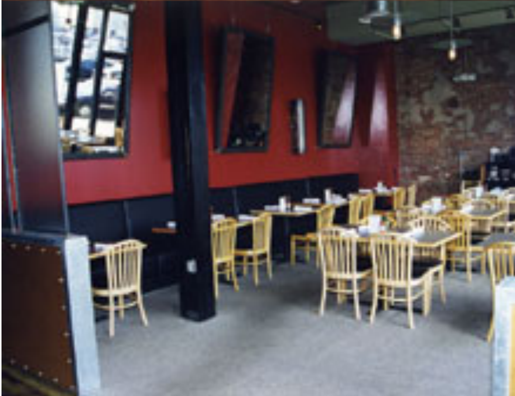
Empire Brewery Buffalo, N.Y.