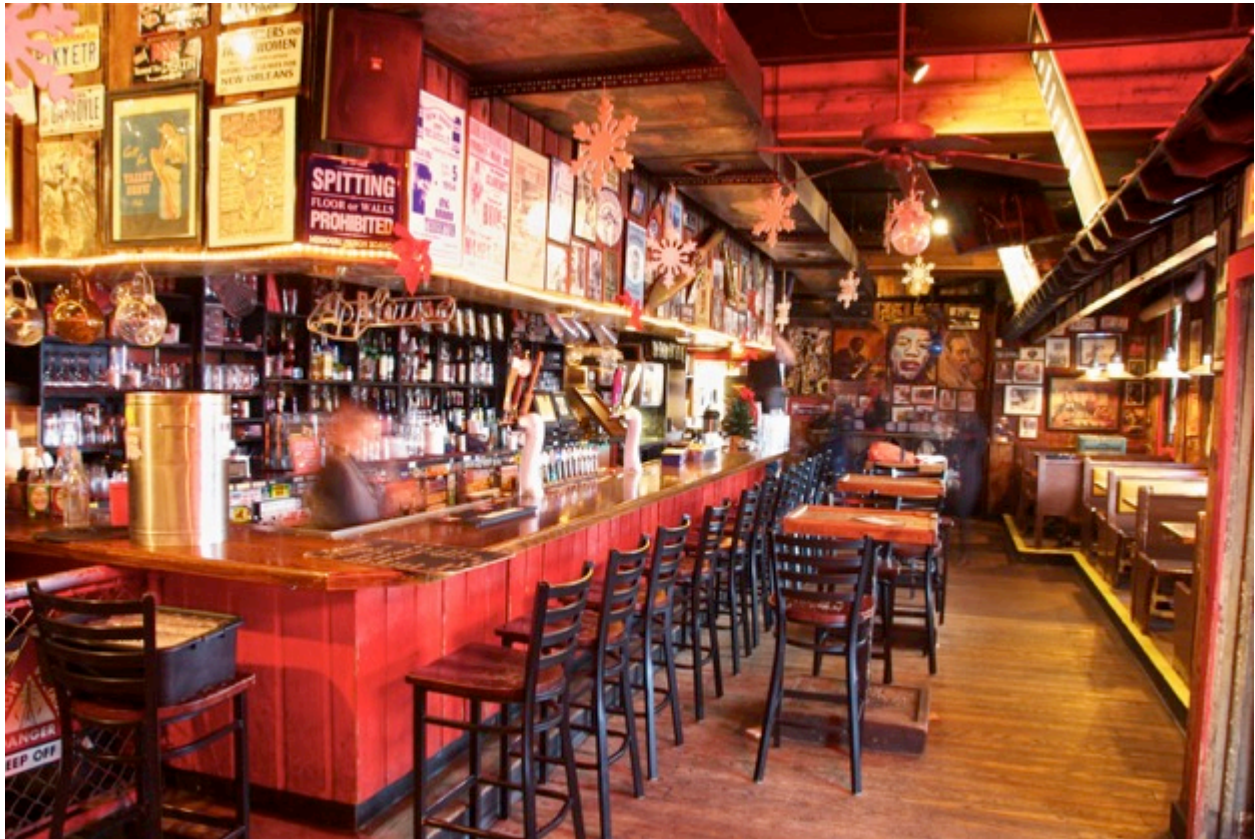
Zebb's Toppings Bar