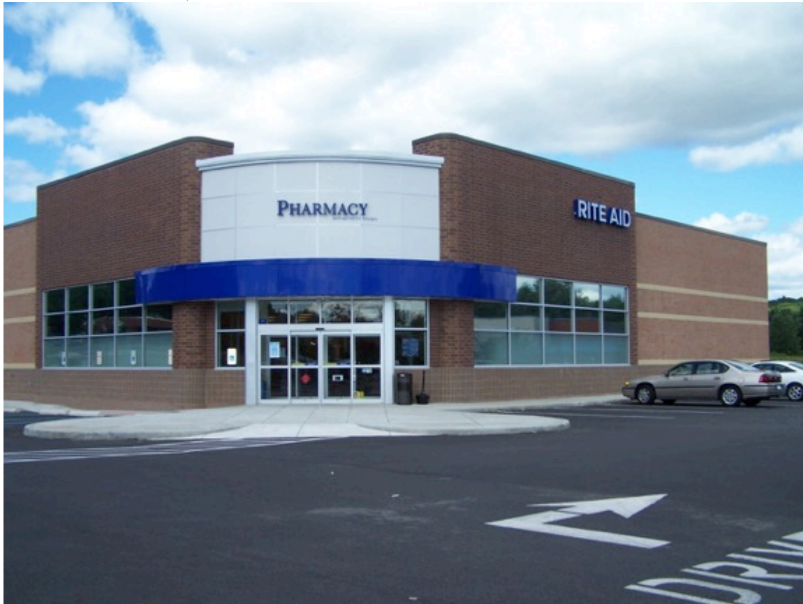
P&C Cazenovia, N.Y.