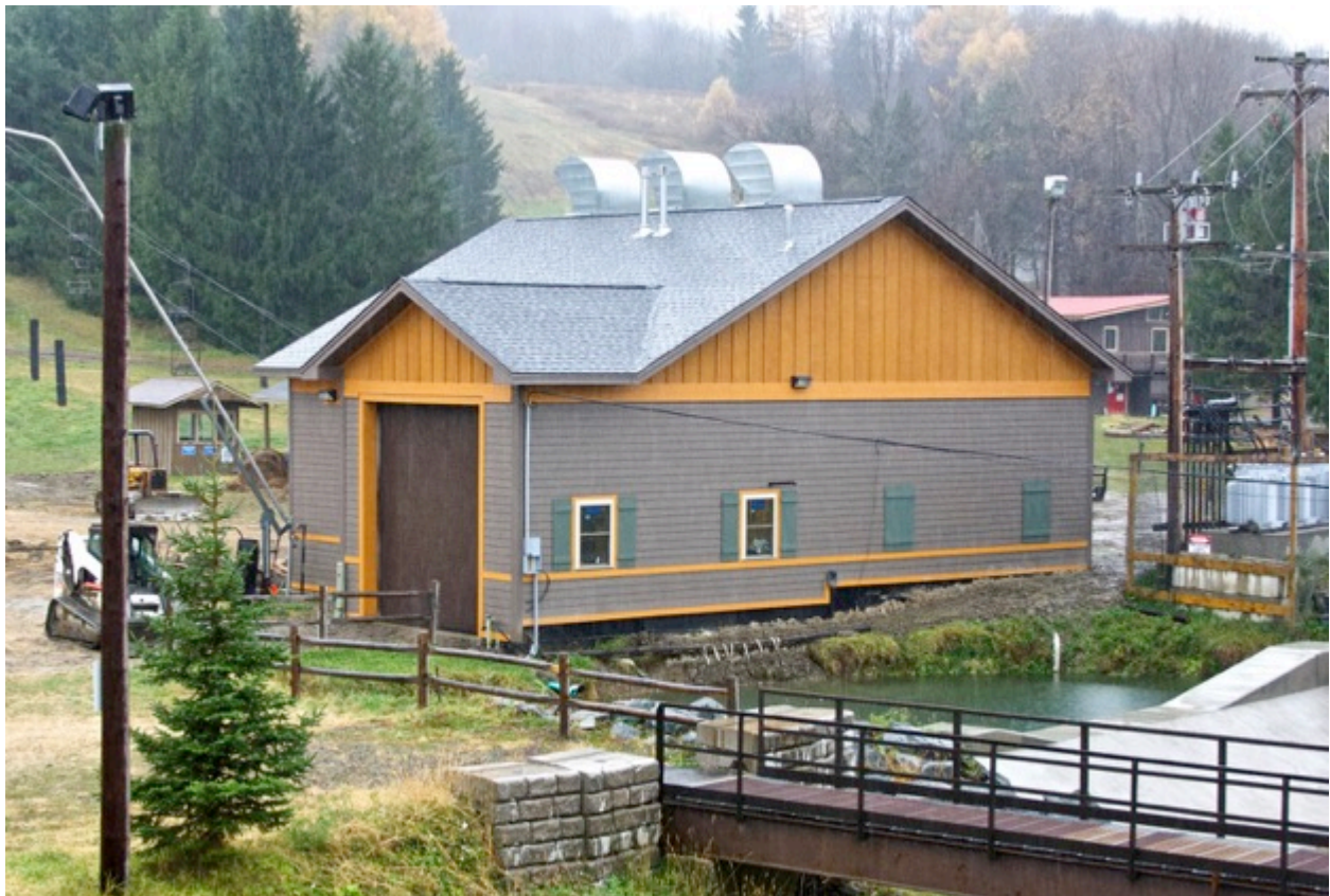
Pump House Greek Peak