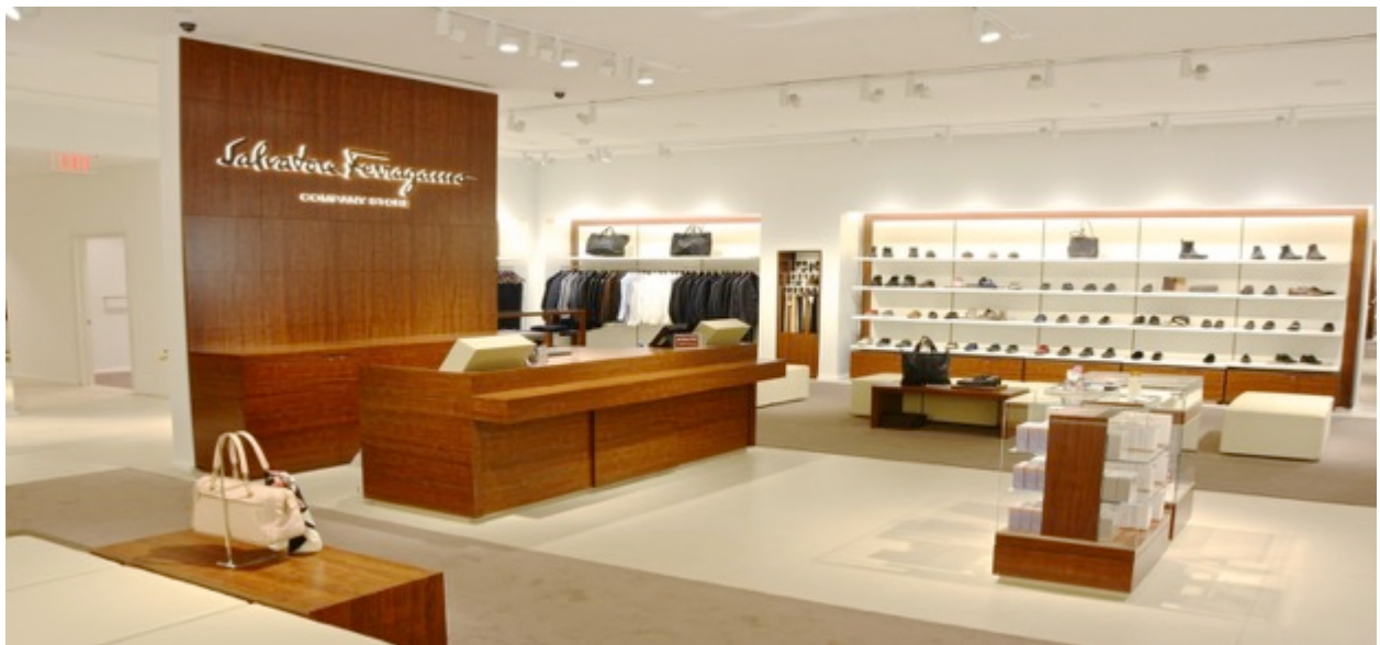
Salvatore Ferragamo Destiny USA