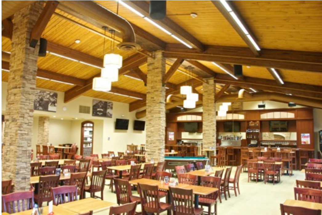
Trax Pub & Grill Greek Peak