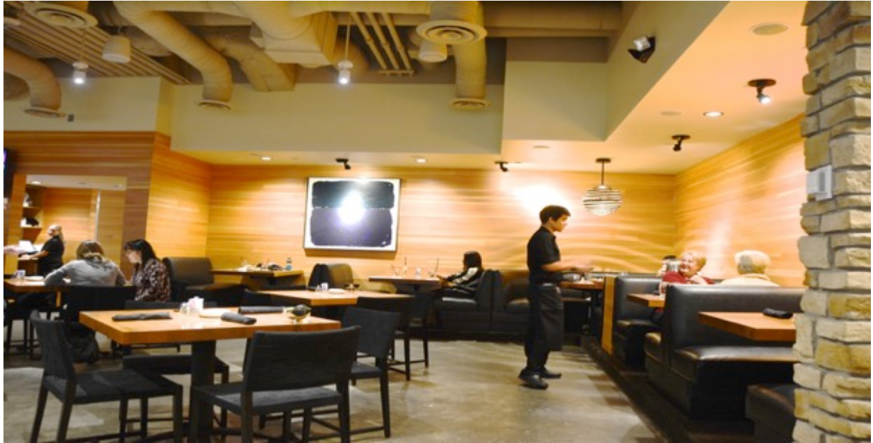
Cantina Laredo Main Dining