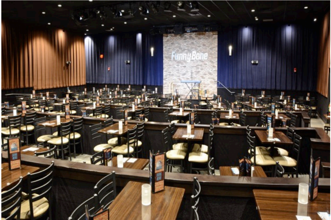
Funny Bones Comedy Club Destiny USA